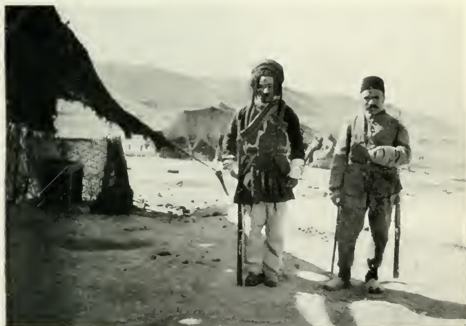
KURDISH CHIEF AND TURKISH GENDARME